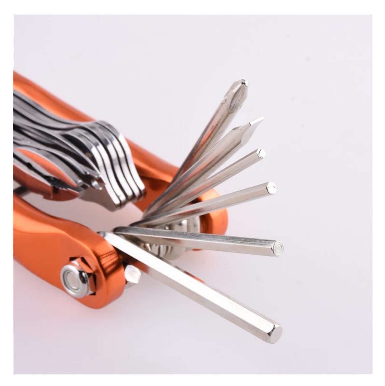
Understanding Bike Repair Tools

Cycling, whether as a means of transportation, a way to keep fit, or as a leisure activity, is a wonderful experience that combines physical exercise with the joy of exploring the outdoors. However, every cyclist knows that with every turn of the pedals, there's a chance of mechanical failure. This is where the importance of a bike repair tool comes into sharp focus. In the following content, we'll explore the basic knowledge of bike repair tools and why they are undoubtedly necessary for every cyclist.