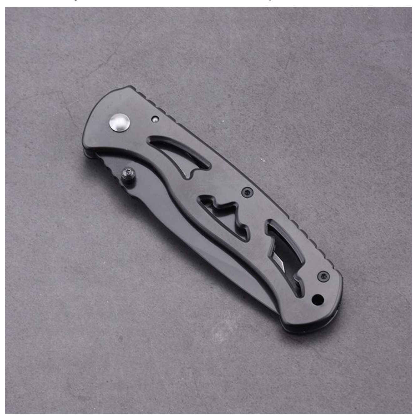
The Essence of the XW-1010

Unveiling the epitome of practical design and robust functionality, the Shieldon XW-1010 folding pocket knife is a testament to Shieldon's unparalleled craftsmanship in the realm of personal cutting tools. Meticulously designed for the discerning user, this knife embodies the reliability and aesthetic appeal that <a href="Shieldon's Manufacturing">Shieldon's Manufacturing</a> & Trading Combo business has refined over the years. Here's a glimpse into the world of the XW-1010, a folding knife that's set to redefine standards in the industry.