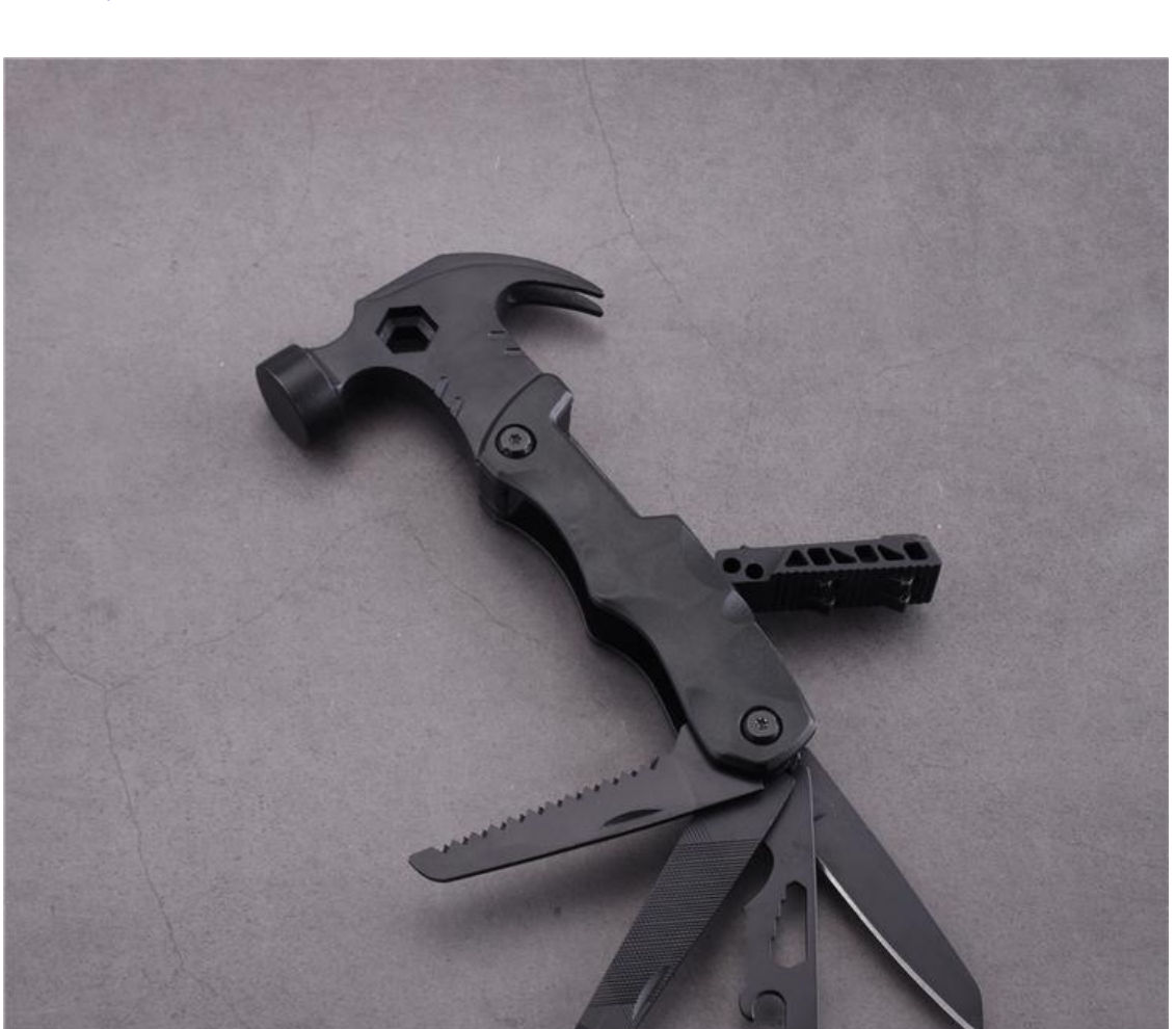
Efficient Blade and Safety Mechanism

The MC-KA-62 is equipped with a 65mm (2.56") blade, sharp and ready for precise cutting tasks. The inclusion of a locking blade feature is a testament to Shieldon's commitment to safety, ensuring that the blade remains securely in place during use, reducing the risk of accidental closures.