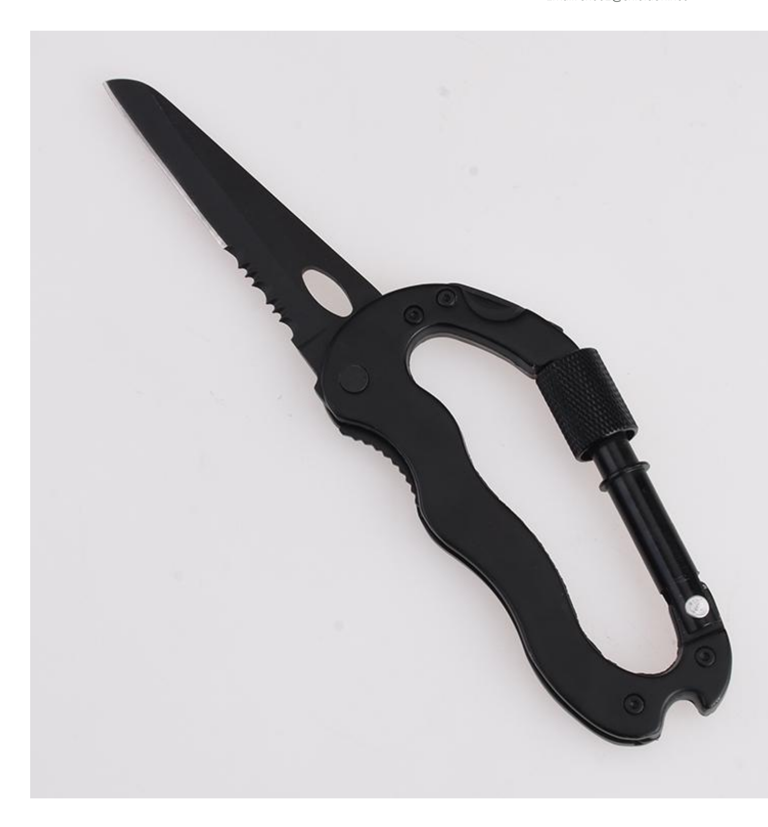
Item NO.: JLD-20670 - The Swiss Army Knife of Carabiners