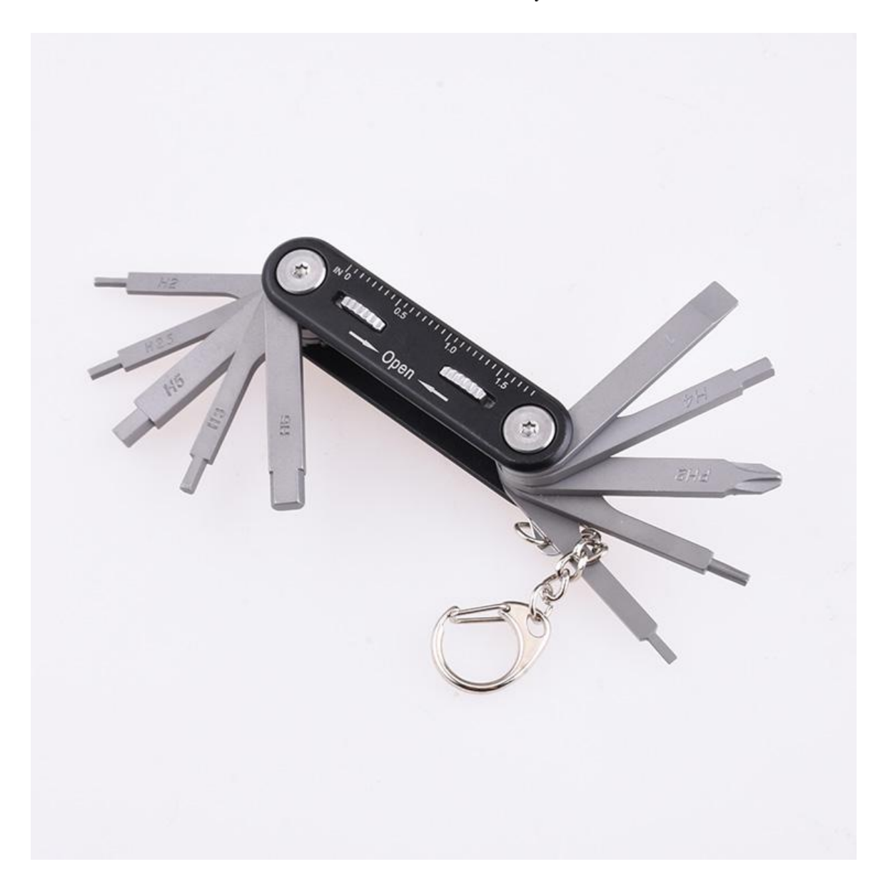
Item NO.: JQ-0001

In the dynamic world of cycling, where every ride brings its own set of challenges, the JQ-0001 emerges as the quintessential companion for any rider. Shieldon Manufacturing & Trading Combo proudly presents this meticulously designed, stainless steel, <u>multi-purpose EDC bike repair tool</u>. With a host of essential functions condensed into a compact and robust form, the JQ-0001 is the embodiment of reliability and versatility. This purchasing description will provide a comprehensive breakdown of its features and the benefits it offers to cyclists.