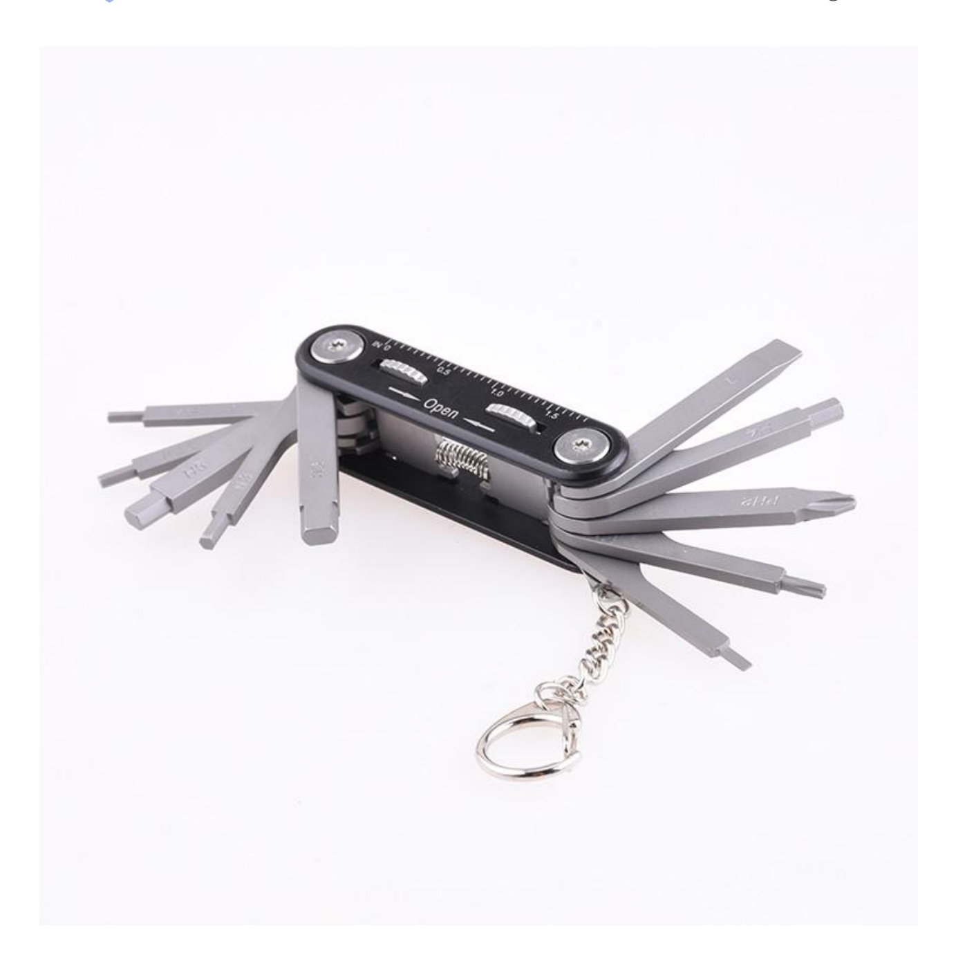
Gear Up: Mastering the Essentials of Bike Repair Tools Within Your Budget

Cycling is a liberating experience, often filled with moments of exhilaration and peace. However, like any trusty steed, your bicycle requires regular upkeep. Understanding the basics of bike repair tools and their cost can be the difference between a smooth ride and a roadside setback. Let's navigate through the various price ranges of bike repair tool models, ensuring you're equipped for maintenance without overspending.