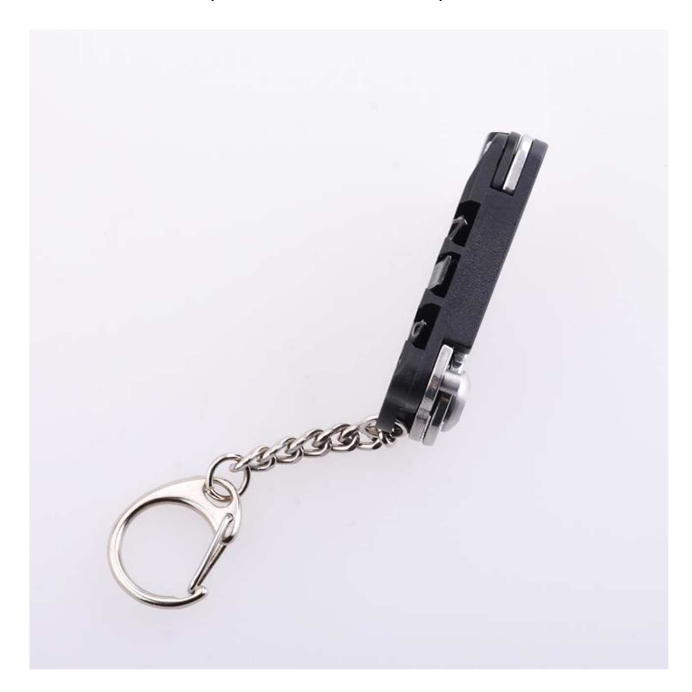
What is EDC?

The Everyday Carry (EDC) concept is not just a trend but a lifestyle choice that celebrates preparedness, efficiency, and personal expression. This exploration will introduce you to the fundamental idea of EDC, tracing its origins and understanding how it has woven its way into the fabric of our daily lives.