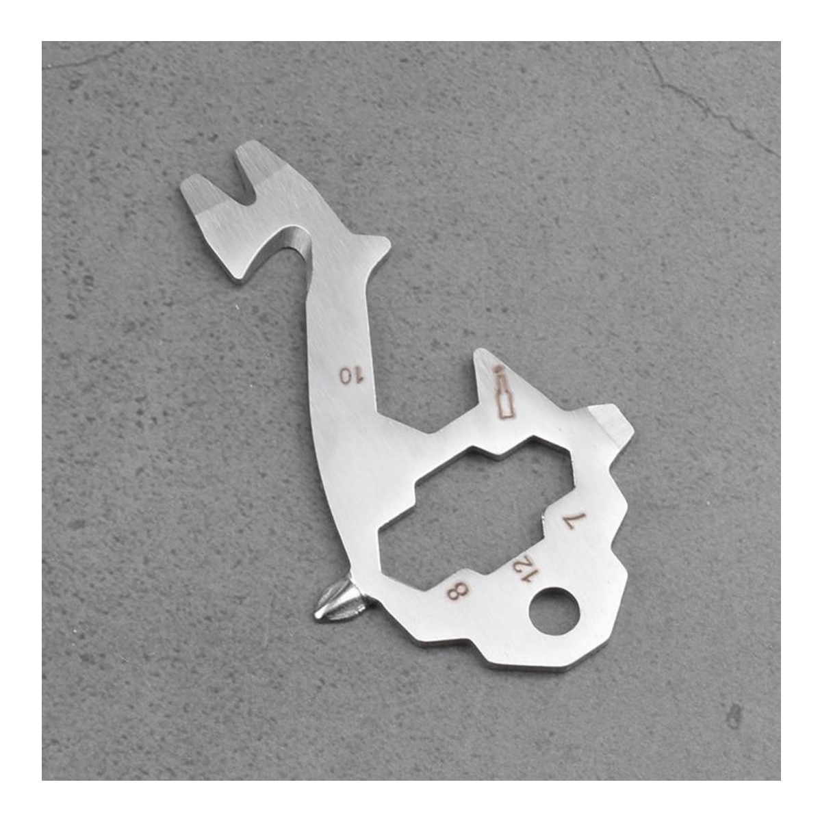
Introducing the YJ-2224

The modern world demands modern solutions, and in the bustling landscape of everyday challenges, the YJ-2224 Ghost Feature <u>EDC tool</u> emerges as a paragon of utility and minimalism. This purchasing description for Shieldon Manufacturing & Trading Combo business endeavors to illuminate the many facets of this remarkable product, designed for those who champion efficiency and elegance in their daily carry.