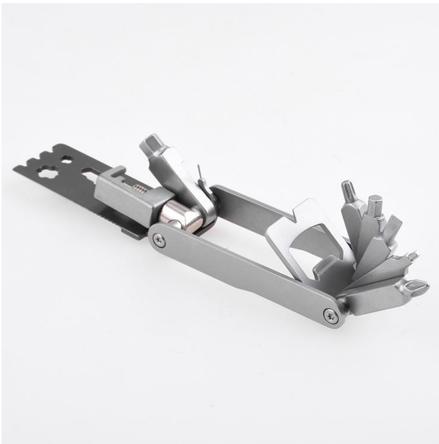
The Basic Bike Repair Tool

Cycling is not just about the joy of the open road or the thrill of the race; it's about being prepared for every twist and turn your journey may present. While having a trusty bike repair tool is essential for any cyclist, there's a whole array of additional tools that are equally important to ensure a smooth and enjoyable ride. Equipping yourself with this basic knowledge is key to becoming a resilient and self-sufficient cyclist.