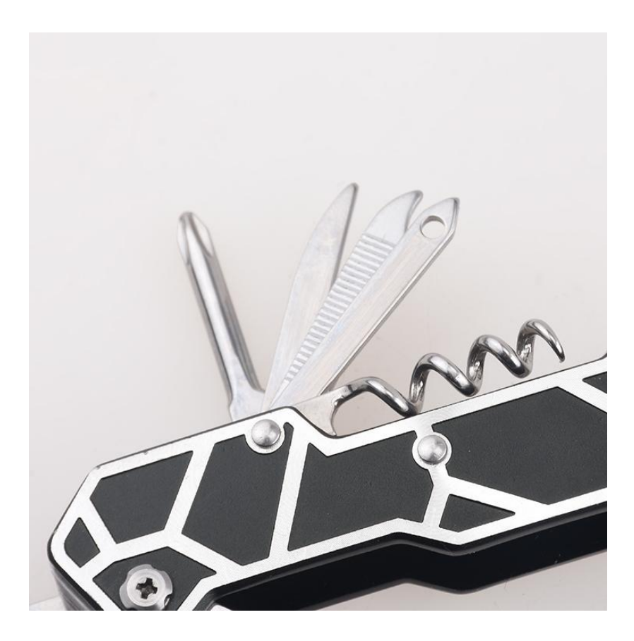
Compact Toolkit on the Go

Army knives, often recognized as Swiss Army knives, have been an indispensable tool for soldiers and outdoor enthusiasts alike, dating back to their origins in the late 19th century. Designed to be compact yet comprehensive, these knives are the epitome of functional design and have evolved to become a staple in everyday carry kits for people around the world. In this piece, we will explore the various applications of army knives, demonstrating why they are much more than just a cutting instrument.