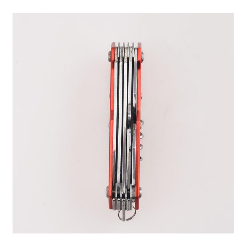
Storage Tips for Specific Knife Components

Even with the best storage conditions, it's wise to inspect your knives regularly. This allows you to catch any potential issues early, such as the onset of rust or a degradation of materials, and address them before they become serious.