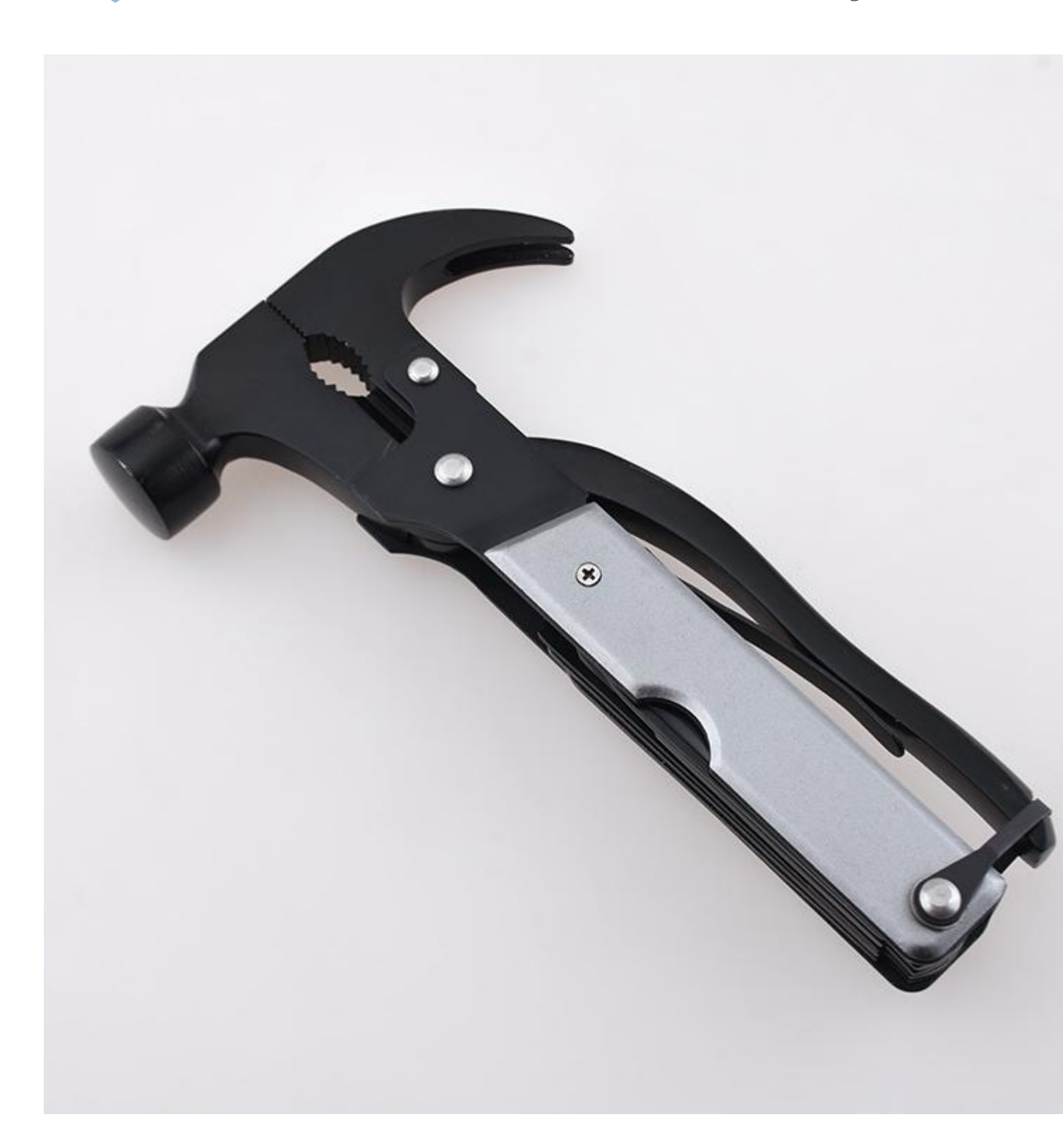
The Hammer: The Heart of the Multi-Tool

At its core, the multi-hammer is, as the name suggests, a hammer. This element is indispensable. Whether you're driving nails into wood, assembling furniture, or setting up a campsite, the hammer provides the necessary force that no other tool can replicate. Unlike a regular hammer, the multi-hammer's compact size makes it perfectly