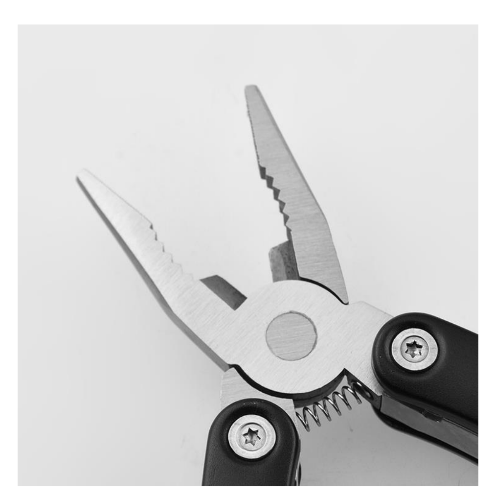
Market Position and MOQ

Coming standard with the option of an Oxford bag, the MC-PA-16H's packaging is as refined as the tool itself. The bag offers an extra layer of protection and a convenient means of transport, with the added benefit of exuding professionalism.